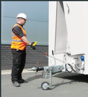
Unhitch from towing vehicle and operate hydraulics using the push button controls

Fast deployment time means more time on the job, making it the money saving choice of welfare unit for rental companies and contractors.