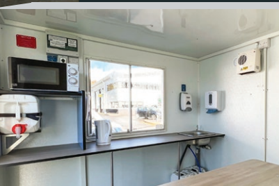
Well equipped canteen