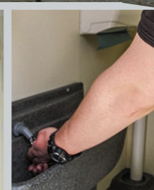
Delivery of hot water