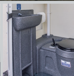
Toilet wash area