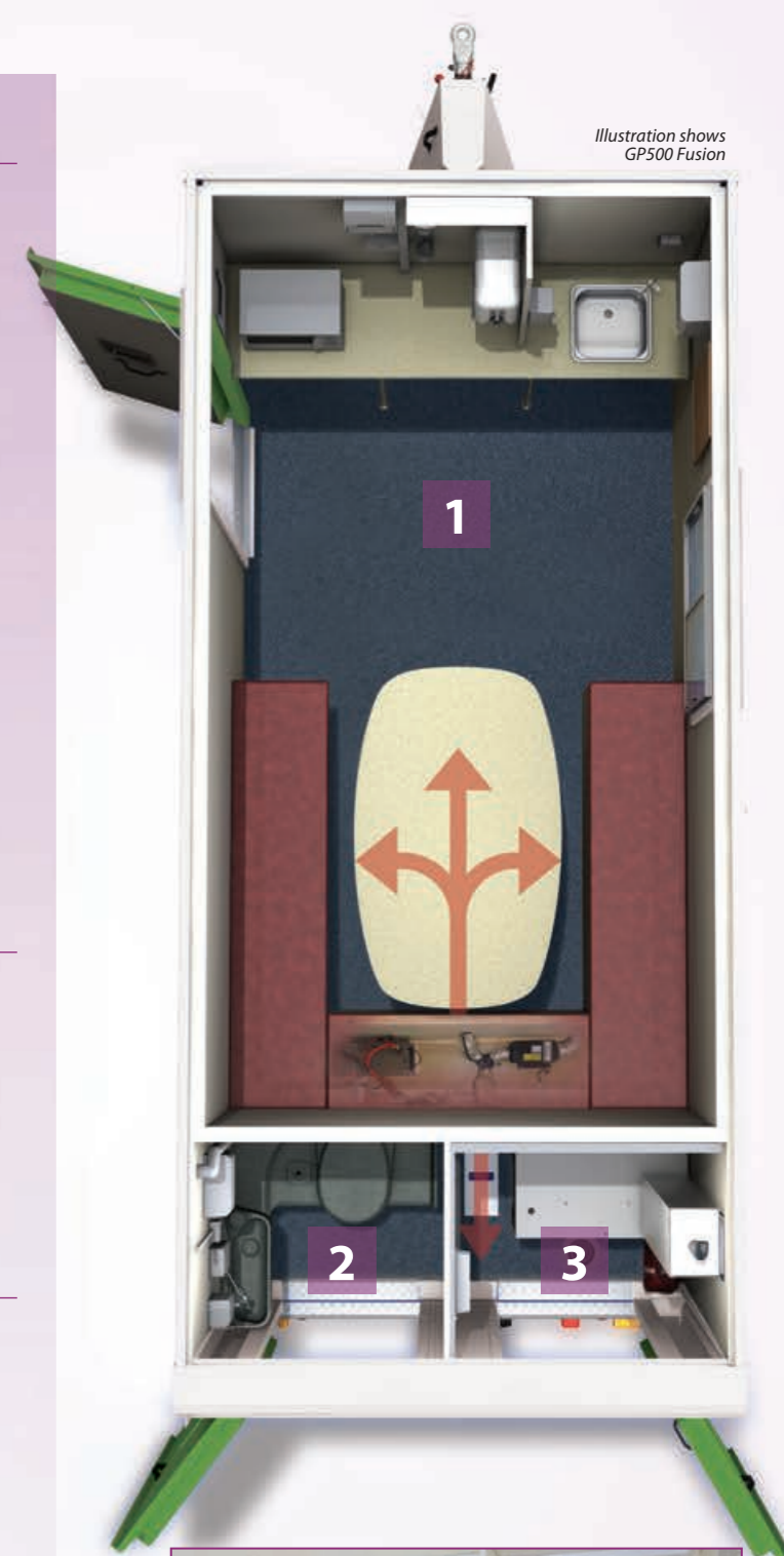
Illustration shows GP500 Fusion