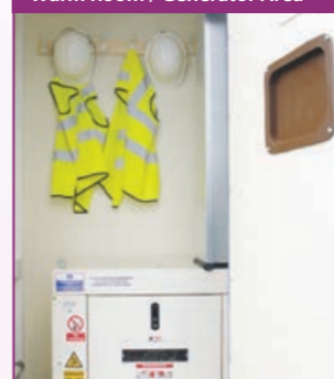
GP500 Fusion Welfare Area