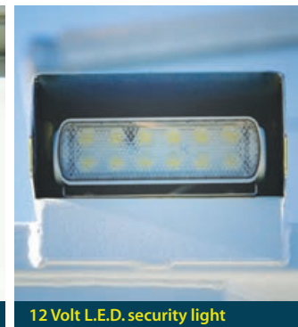
12 Volt L.E.D. security light