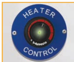
Indicator light on