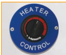
Indicator light off