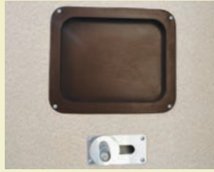
High secure double lock door with integral window and vent