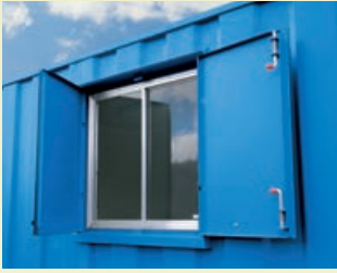
High security window shutters