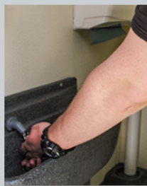
Delivery of hot water