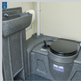
Toilet wash area