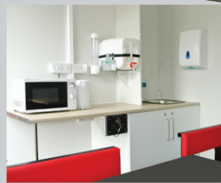
Well equipped canteen

Incredibly robust and efficient incorporating all the latest standard features.