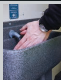
Delivery of hot water