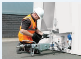
Close & lock canopy to protect towing facility