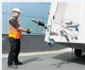
Lower unit to the ground and unplug controls