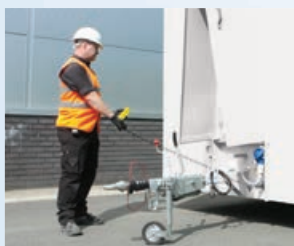
Unhitch from towing vehicle and operate hydraulics using the push button controls

Easily towed, one man operation secured and manoeuvred on site. Its many safety features make it a high secure and money saving choice of welfare unit for rental companies and contractors.