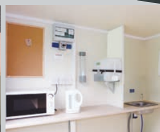
Well equipped canteen