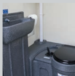
Toilet wash area