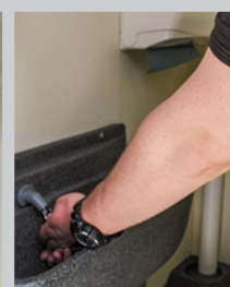
Delivery of hot water