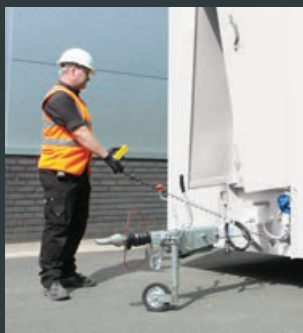
Unhitch from towing vehicle and operate hydraulics using the push button controls

Fast deployment time means more time on the job, making it the money saving choice of welfare unit for rental companies and contractors.