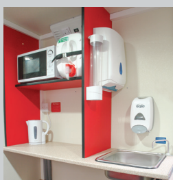
Well equipped canteen