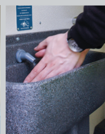
Delivery of hot water