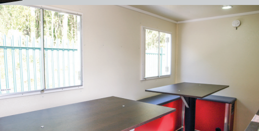
Spacious seating area