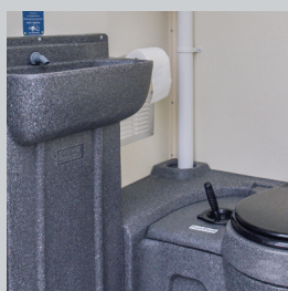
Toilet wash area