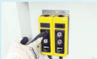
Push button controls to lower front and rear hydraulic rams

Easily towed, one man operation secured and manoeuvred on site. Its many safety features make it a high secure and money saving choice of welfare unit for rental companies and contractors.