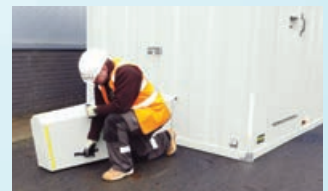
Unit is lowered and canopy locked to protect towing facility