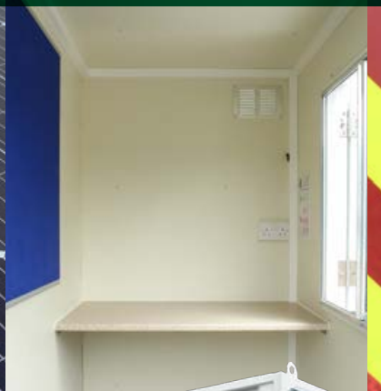
Separate office area