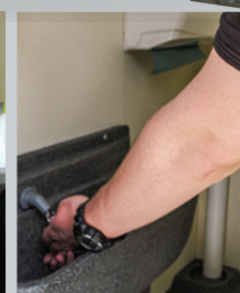
Delivery of hot water

Innovative, functional, environmentally efficient and cost effective.