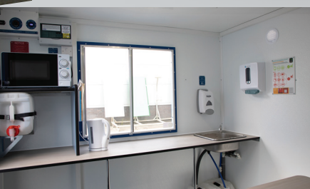
Well equipped canteen