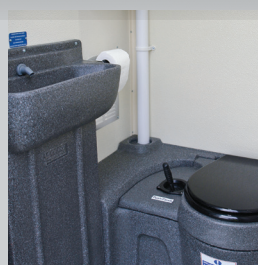
Toilet wash area