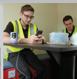
Inverter powered USB sockets